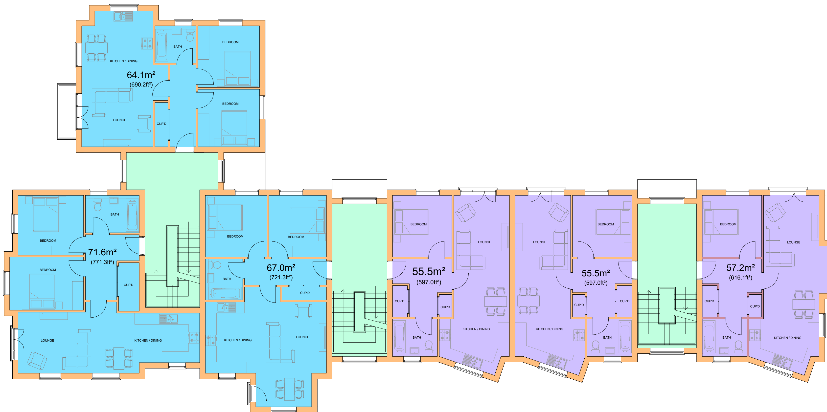
FIRST FLOOR LAYOUT - 466.67m 2 (5023.28ft 2 )